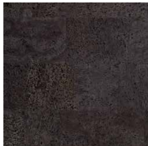
ANTIQUE LEATHER AMBIENT RC-ANTLEATH