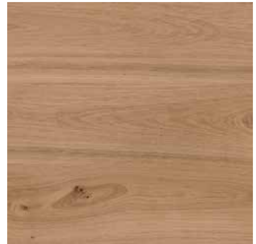
OAK ANTIQUE VITA RCV-OAKANTIQUE