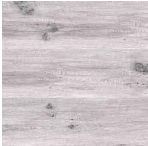
OAK BLANC VITA RCV-OAKBLANC

PLANK SIZE: LENGTH: 1746 MM | WIDTH: 194 MM | THICKNESS: 13.5 MM | 1 BOX: ± 1.69M²