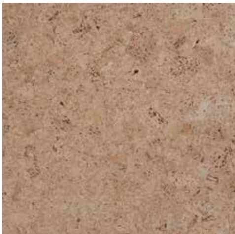
CHAMPAGNE SAND AMBIENT RC-CHAMPSAND