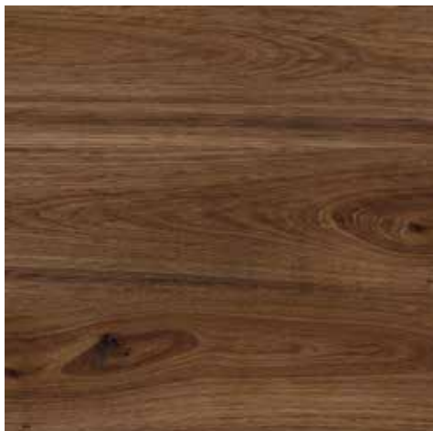
OAK JAVA VITA RCV-OAKJAVA