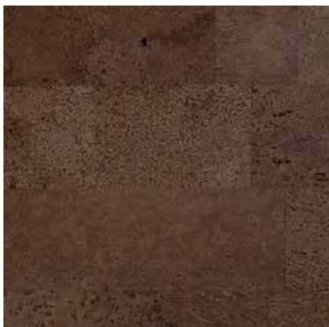
RUSTIC OLIVE AMBIENT RC-RUSTOLIVE