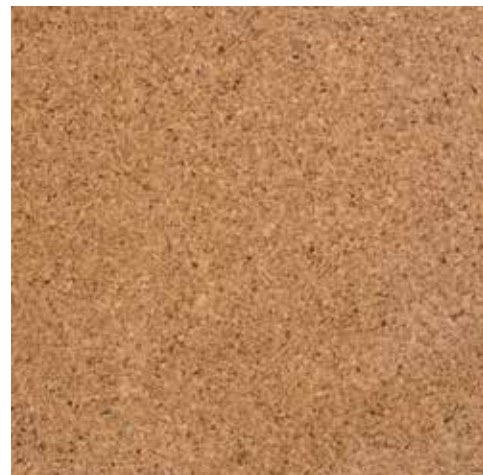
TRADITIONAL AMBIENT RC-TRAD