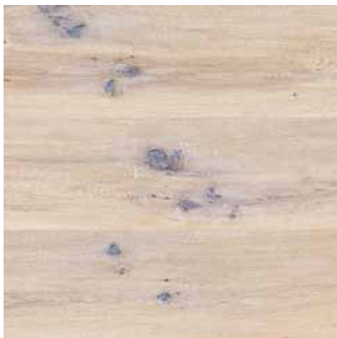
OAK PEARL VITA RCV-OAKPEARL