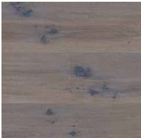
OAK SIENA VITA RCV-OAKSIENA