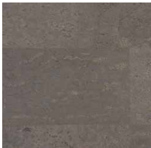
SLATE AMBIENT RC-SLATE