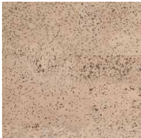
HARMONY IVORY AMBIENT RC-HARMIVORY

TILE SIZE: LENGTH: 910 MM | WIDTH: 300 MM | THICKNESS: 10.5 MM | 1 BOX: ± 1.64 M 2